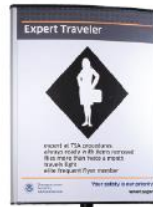
Basic: Silver Frame Black Post