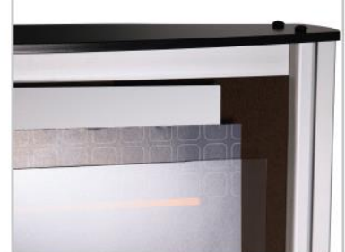
Paper Poster Holder: Rigid white sintra backer and a clear PETG protective panel. Ideal for temporary signage.