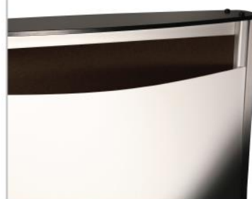
Printed Rigid Sign: Graphics are printed directly onto PETG and laminated to prevent scratching. Ideal for more permanent signage.