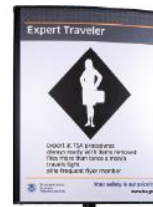
Black: Black Frame Black Post