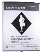
Silver: Silver Frame Silver Post